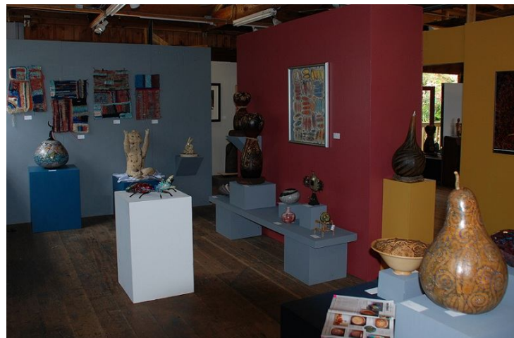
Hawaii: The all-Big Island entries exhibition at The Donkey Mill in Holoaloa.

and the executive director of The Contemporary, she brings a rich history and unique point of view of the current state of the arts in Hawaii. Please try to attend her lecture at 4:30, which was very well-received on Kauai, Maui and Hawaii. Immediately after, notification of acceptance and/or pick-up of work not selected will run until 7:30pm.