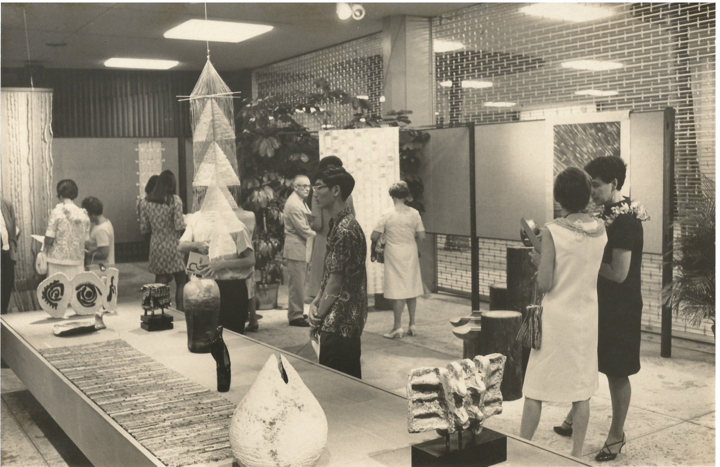
HAWAII CRAFTSMEN 1ST ANNUAL EXHIBITION, OCTOBER 12-21, 1967, ALA MOANA CENTER LANAI EXHIBIT AREA