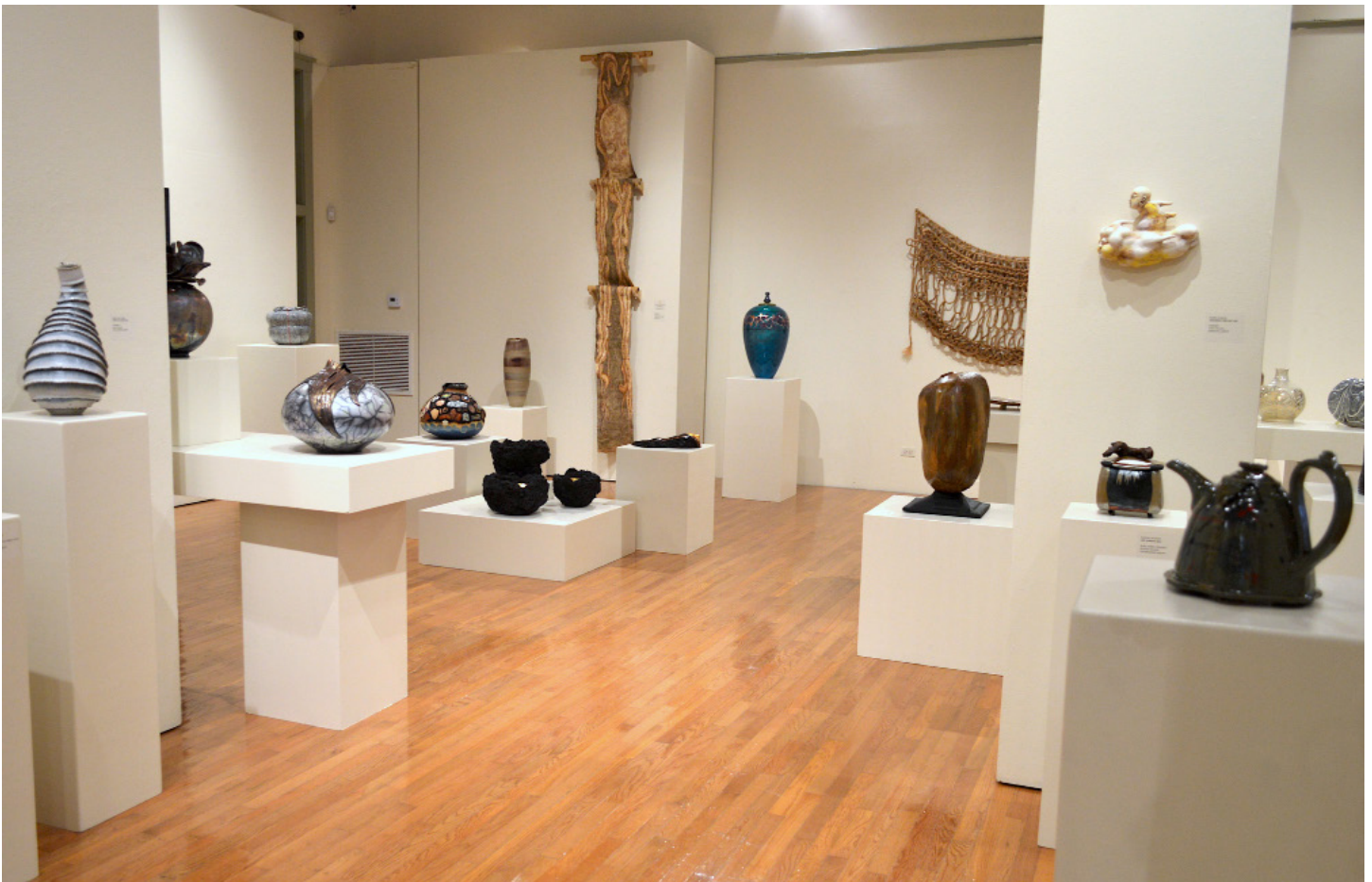
HAWAII CRAFTSMEN 50TH ANNUAL STATEWIDE JURIED EXHIBITION, OCTOBER 25-NOVEMBER 10, 2007 HONOLULU MUSEUM OF ART SCHOOL MAIN GALLERY

In 2017, Hawaii Craftsmen expanded its mission of bringing nationally-known art professionals to the state by inviting the world-renowned Kenyan-British artist, Magdalene A. N. Odundo, O.B.E., to jury the milestone 50th Annual Statewide Juried Exhibition. With 103 art works selected from over 350 submitted entries from across the state, this annual exhibit clearly demonstrates the lasting endurance and undisputable maturity of fine crafts in Hawaii.