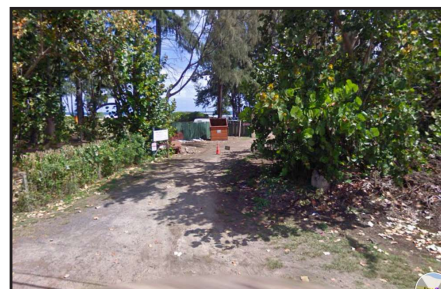
Our entrance to Camp Mokule'ia

Camp Mokule'ia, Waialua Enter from Farrington Hwy., accross from Dillingham Field