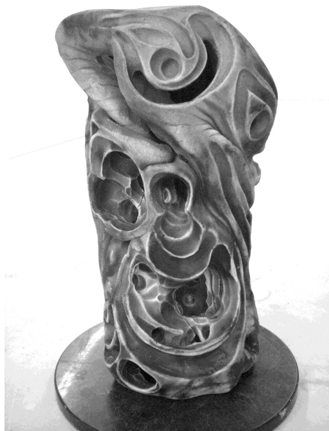
Burnt Decadence, Yukio Ozaki

Artwork from Lana'i and Moloka'i will be juried via online submission. Registration must be processed through www.hawaiicraftsmen.org by Sept.30, 12am to be considered by the juror. Images must be submitted, no more than two per entry, via email in the following format: jpeg, no larger than 3MB. Title each image; artist last name_title_slide#. Email your images, description, and registration/receipt number to Abigail.good@gmail.com . Entitle your email "ASJE Slide Submission". Abbreviate slide titles as needed. Selected artwork must arrive at the gallery no later than Oct.7 to be included in exhibition. Entrant will pay for shipping to Honolulu, Hawaii Craftsmen will pay return shipping up to $150 per piece. Accepted artwork will be announced Oct.1.