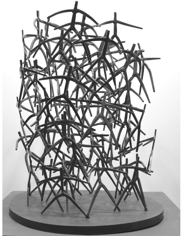
80 Men , Satoru Abe

Sunday, October 5, 5:30pm-6:15pm Rm. 100