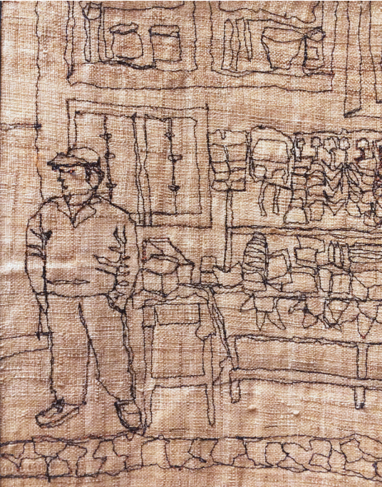
Detail of Carol Yotsuda’s award-winning, The Universal Vendor

A‘weo‘weo, the Fresh Catch 99% cotton-1% cotton/poly Fabric, hand-dyed, hand-printed; machine quilted $1100